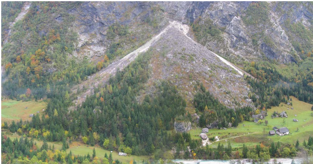
Slika 1. Skalni podor Osojnik v dolini Trente. Figure 1. The Osojnik rockfall in the Trenta valley.

Skalni podori različnega dosega so predvsem v gorskem svetu pogosta in obnem zaradi svoje energije običajno zelo intenzivna oblika naravnih tveganj (Brilly et al. , 1999). Tipičen primer skalnega podora v ozki alpski dolini je npr. podor Osojnik v dolini Trente (slika 1).